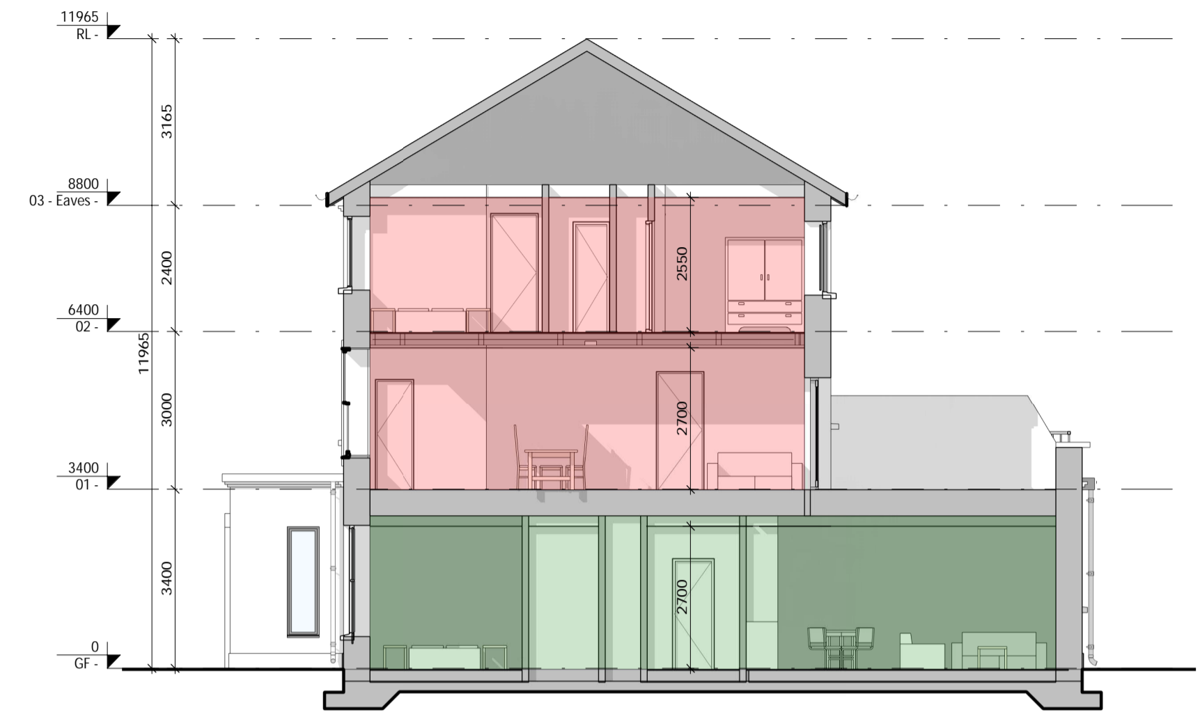
3 Section AA 1:100