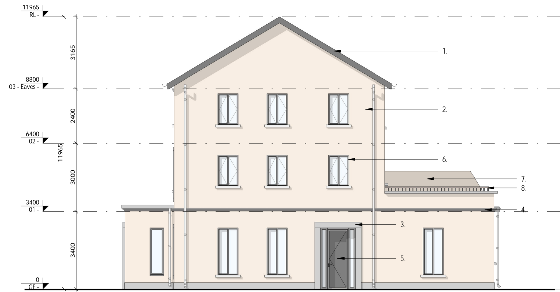
2 Side Elevation 01 1:100