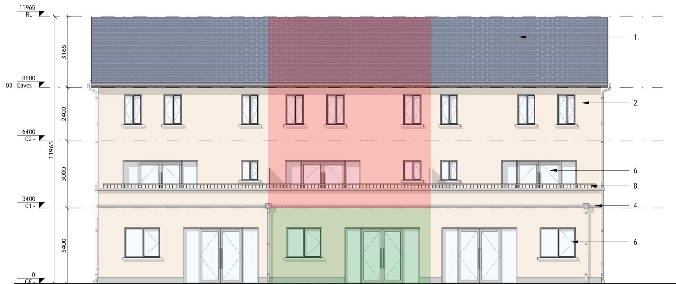
4 Rear Elevation 1:100