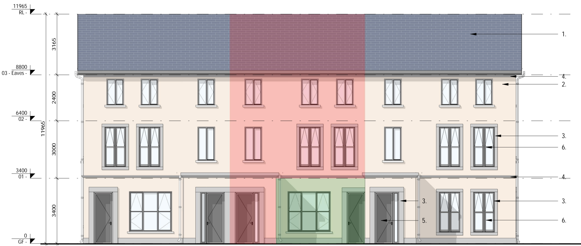
1 Front Elevation 1:100